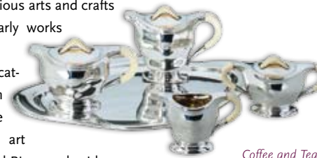
Coffee and Tea Service , Delheid Frères, Brussels, c. 1930, silver, ivory