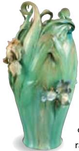
„Iris“ vase , Albert Klein, KPM Berlin, 1899, porcelain

Chronological survey from the turn of the century up to the thirties. Within the interplay of furniture, decorative arts, paintings and sculpture each form of artistic expression is shown to bear a weight of its own. The variety of decorative arts during this period