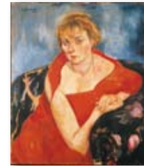
Willy Jaeckel, Portrait of the artist's wife , 1923, oil on canvas

Two rooms are dedicated to Paul Thiersch with objects of the Burg Giebichenstein art school and to Richard Riemerschmid.