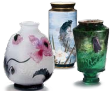
Vase with poppies , Daum Frères & Cie, Nancy, c. 1897, glass