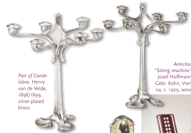
Pair of Candelabra , Henry van de Velde, 1898/1899, silver-plated brass

Special Exhibitions, Henry van de Velde and Josef Hoffmann Cabinets