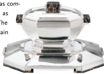
Tureen on Stand , Lapparra, Paris, 1929, silver, marble

beautiful ensembles of furniture designed by celebrities such as Eugène Gaillard, Hector Guimard, Louis Majorelle and Jacques-Emile Ruhlmann.