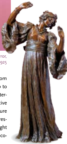
Suite , Maurice Dufrene (?), mirror, table, Edgar Brandt, Paris, c. 1925