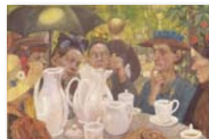
Hans Baluschek, Families can make coffee here , 1895, gouache on cardboard