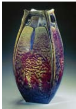
Floor Vase , Henry van de Velde, 1902, stoneware