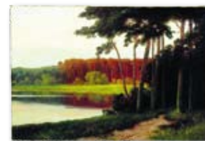
Walter Leistikow, Grunewaldsee or Schlachtensee , c. 1900, oil on canvas