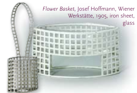
Flower Basket , Josef Hoffmann, Wiener Werkstätte, 1905, iron sheet, glass